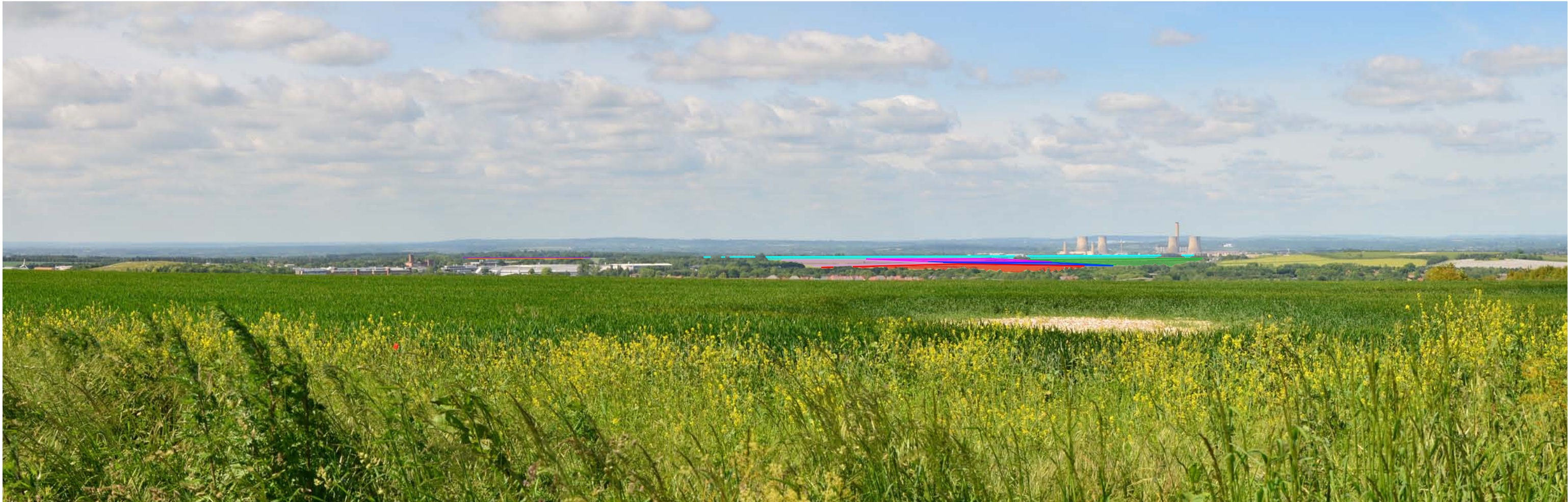
View 6: Indicative extent of all areas.