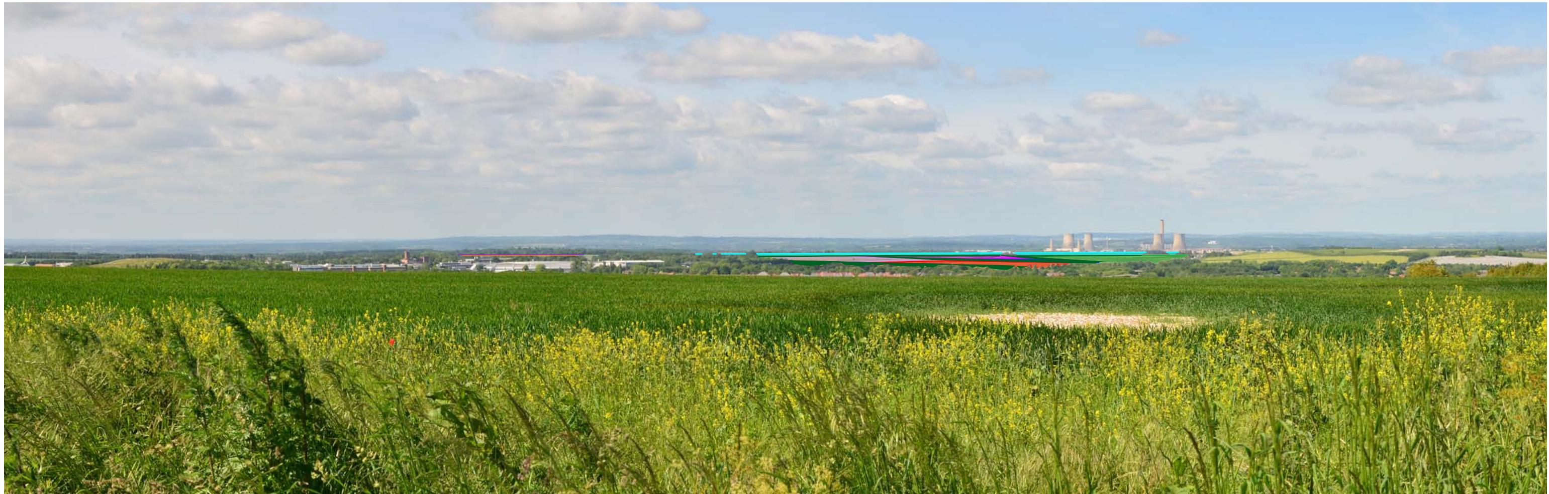
View 6: Indicative extent of all areas - with planting.