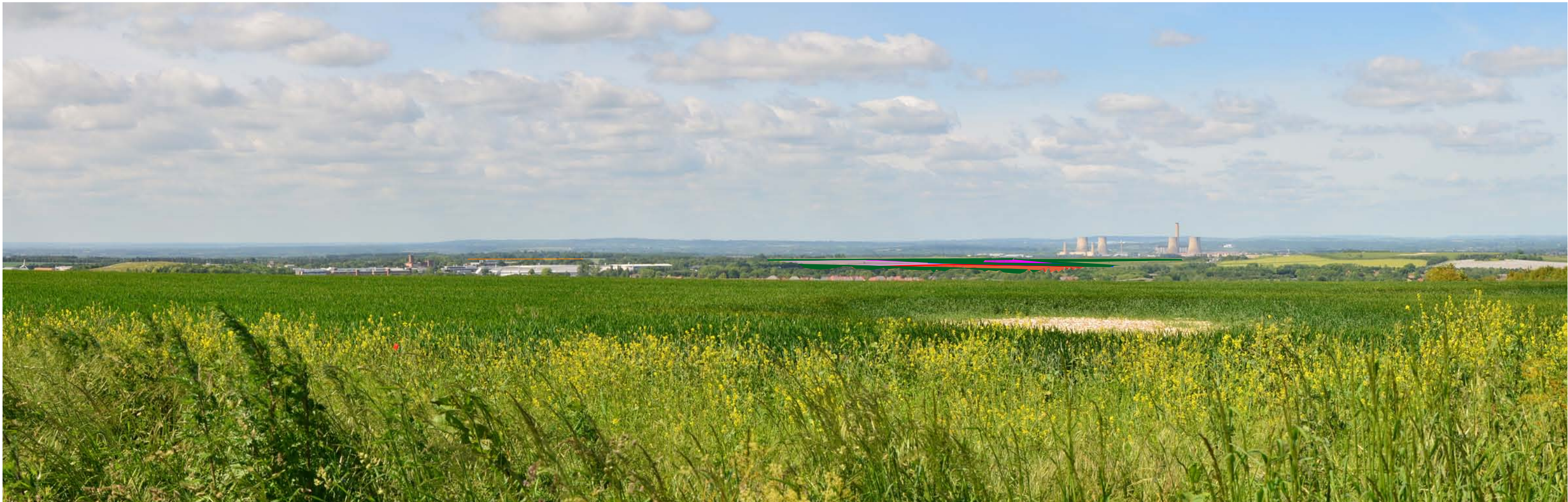
View 6: Indicative extent of Areas A, B, C, D and G - with planting.