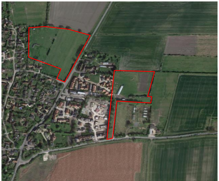
Aerial Image of Proposed Allocations at East Hanney

2.15. Accordingly question marks relate to the suitability of these allocations as well as their ability to meet the unmet needs of Oxford by comparison to better located sites closer to Oxford, albeit within the Green Belt, but on sites found by the Council to be acceptable in Green Belt terms.