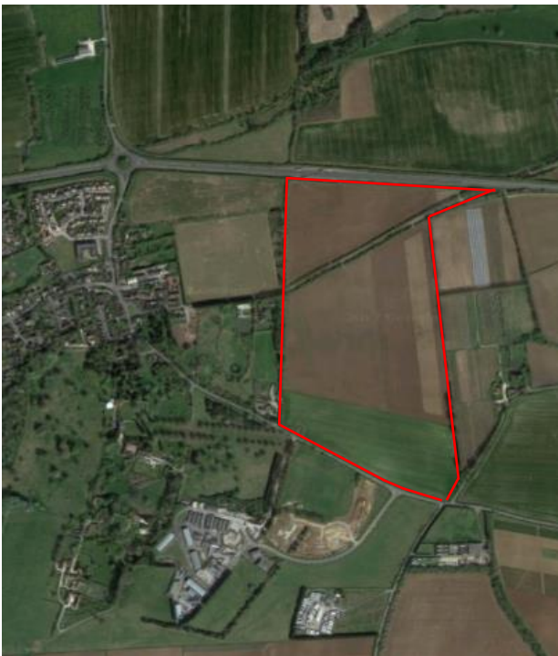
Aerial Image of Proposed Allocation at Kingston Bagpuize and Southmoor

2.14. These locations that are of a significant distance from Oxford and the suggested reliance upon the services along the A420 are over stated. Whilst beyond the greenbelt examination of these proposals, as illustrated in the aerial photographs below highlights the significant environmental impacts that arise from these proposals, the absence of logical containment to the sites with the resulting significant impact on the character and appearance of the rural area.