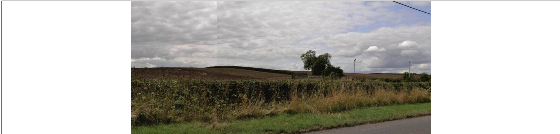
Photo 1: View south from edge of settlement towards rising, open ground