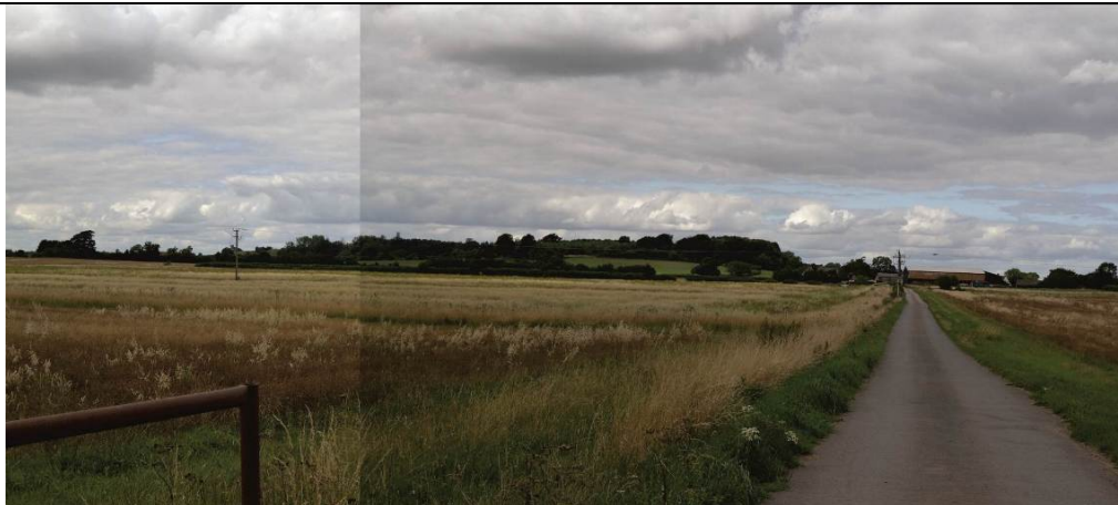
Photo 2: View south-west across open fields from Steeds Farm drive