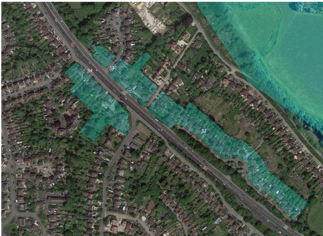
Figure 4-1 Map Showing the Botley AQMA and Air Quality Monitoring Locations

The extent of the Botley AQMA can be seen below in Figure 4-1.