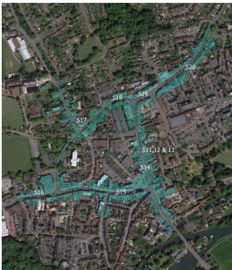
Figure 3-1 Map Showing the Abingdon AQMA and Air Quality Monitoring Locations

The extent of the Abingdon AQMA can be seen below in Figure 3-1.