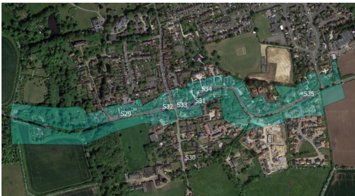
Figure 2-1 Map Showing the Marcham AQMA and Air Quality Monitoring Locations

The VoWHDC states in the 2018 Air Quality Annual Status Report 3 that “the issues also relate to the very close proximity of houses to the busy A415. This road suffers congestion issues because it is not wide enough to allow two large vehicles to pass in opposite directions. There are regular exceedances of NO 2 objectives at properties near the pinch point.” This can be seen in Figure 2-1 below.