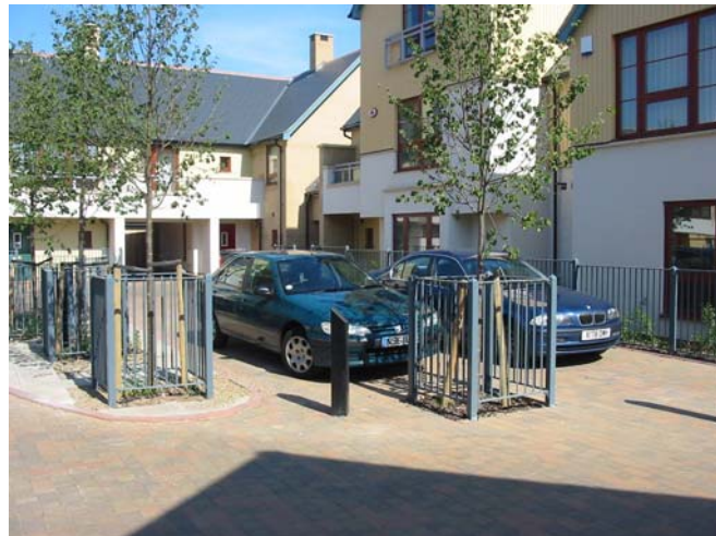
The result of a missing bollard or poor design? (designs have to eliminate poor parking habits)