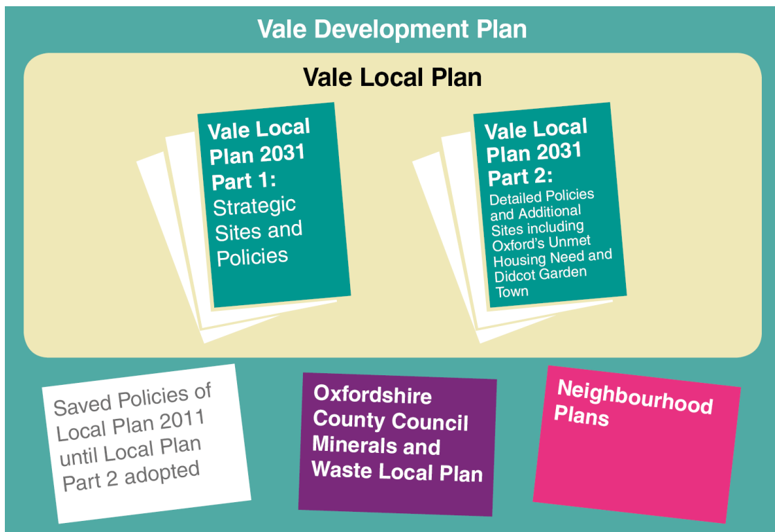
Figure 1.1: An illustration of the documents that make up the Vale of White Horse Local Plan and Development Plan