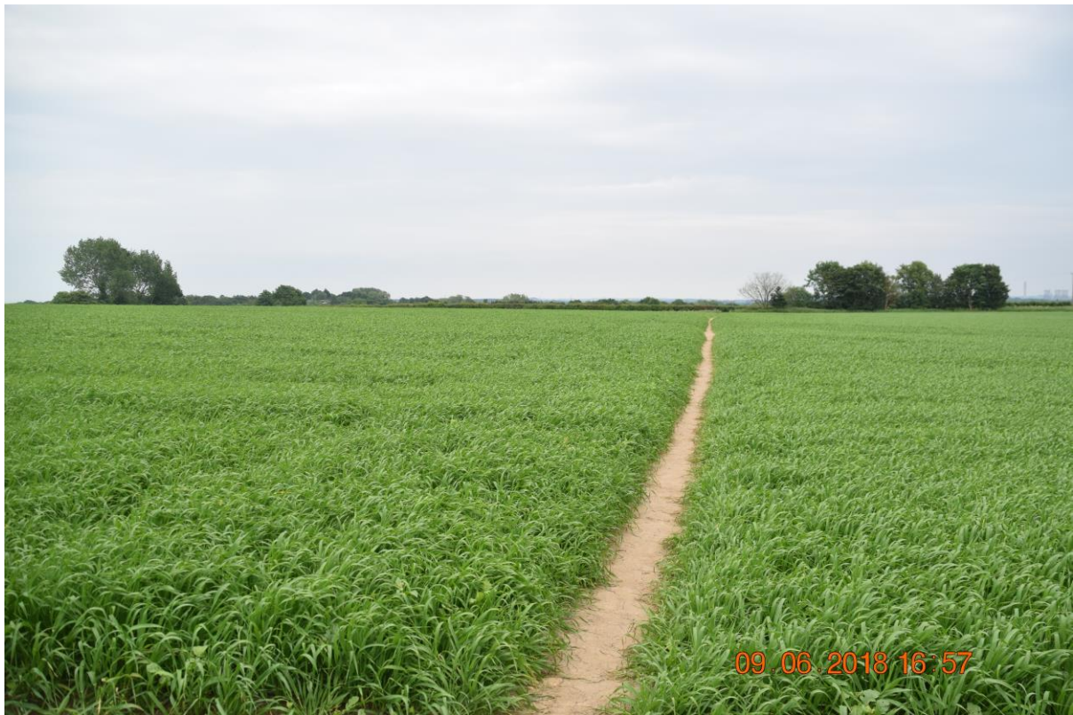
7. Looking south east – main route runs along the hedge line (again straddling the existing hedgerow). This is the highest point of the ridge feature running between the A34 and Sunningwell Village.