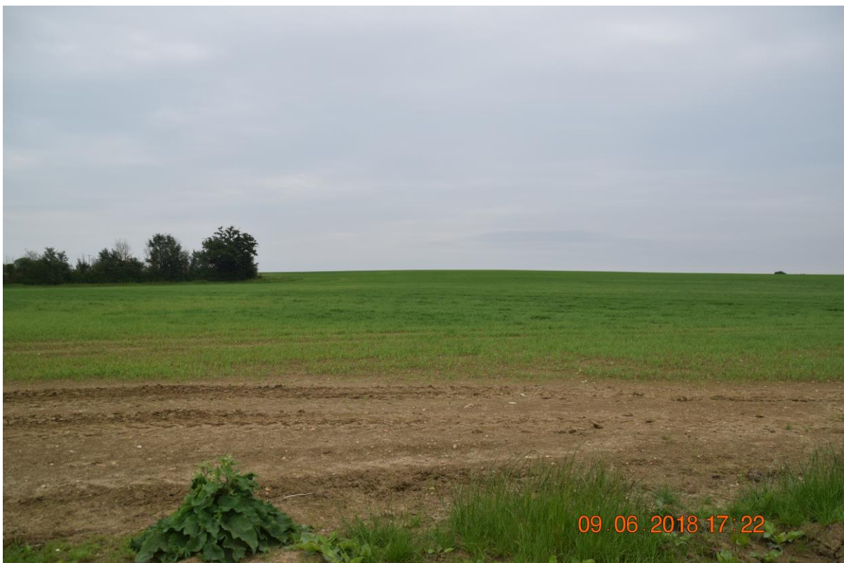
12. Wootton Road route runs on lhs of picture. Long Furlong route joins near horizon just to rhs of trees and then runs to the right towards the Sunningwell Rd along the horizon. Picture again shows subdivision of fields caused by the routes