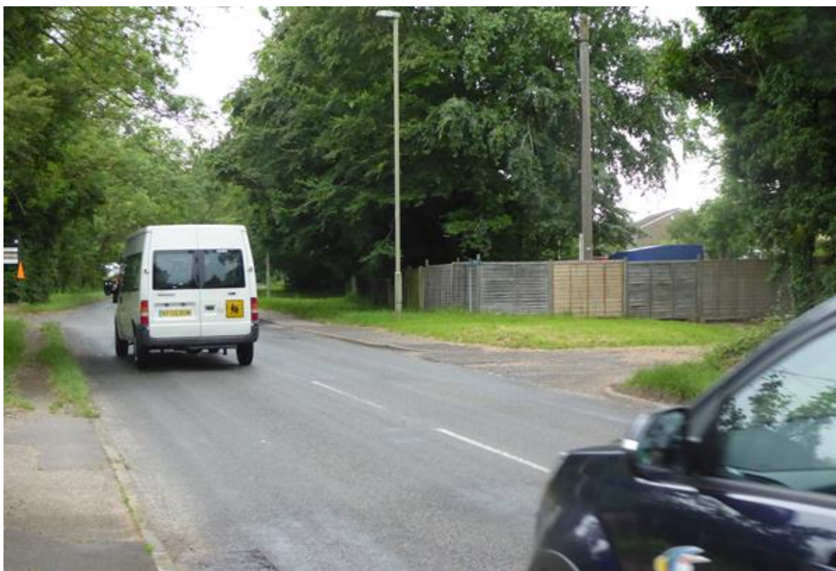
22. Junction of Wootton Road route and Wootton Road from the south east