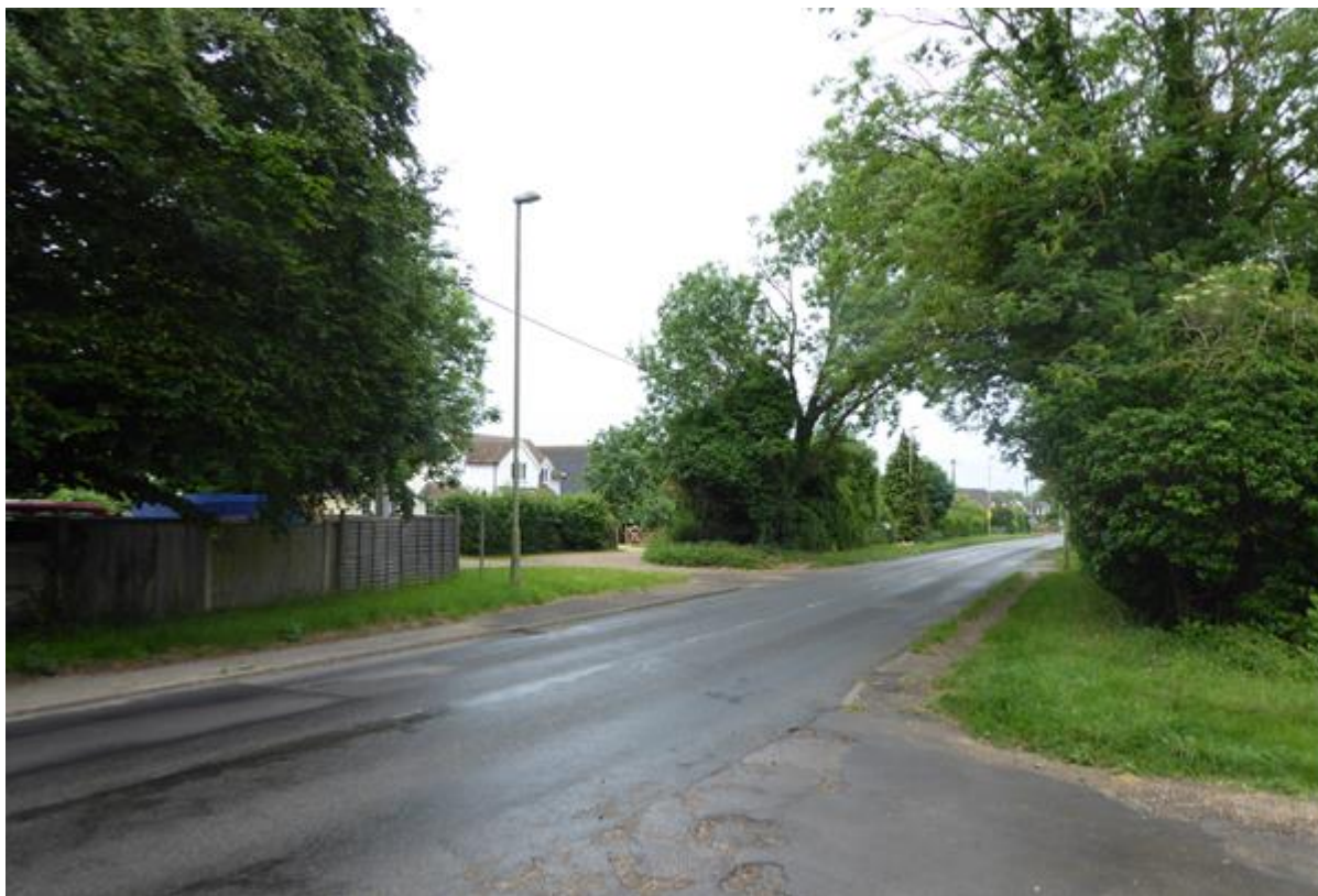
21. Junction of Wootton Road route and Wootton Road from the North West