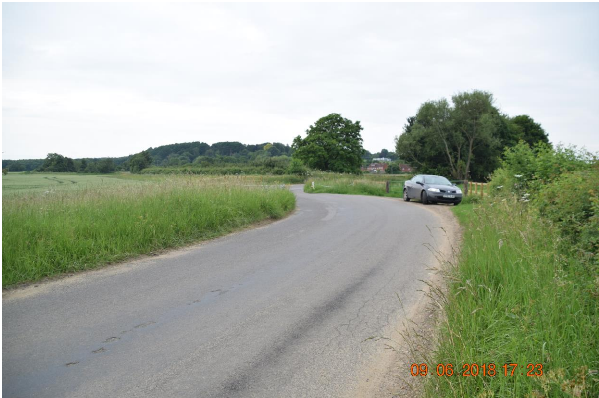
13. Point at which the Wootton Rd leg crosses the Sunningwell Road. Note this is on a double bend which crosses a culvert and is the scene of multiple accidents. It appears to be a particularly dangerous location for the junction with added engineering difficulties