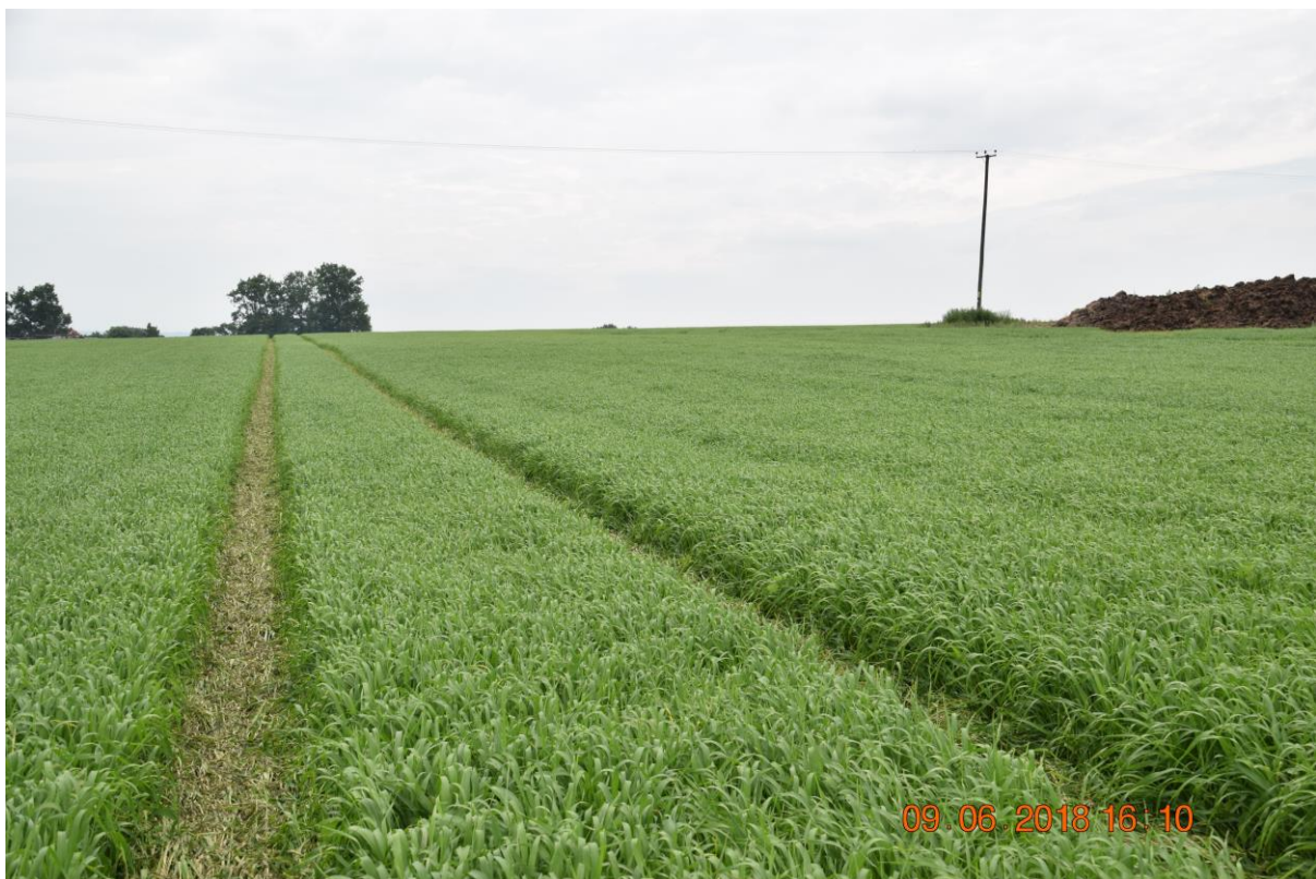
2 Main route on horizon to rhs of picture. This is the highest point of the ridge feature running between the A34 and Sunningwell Village.