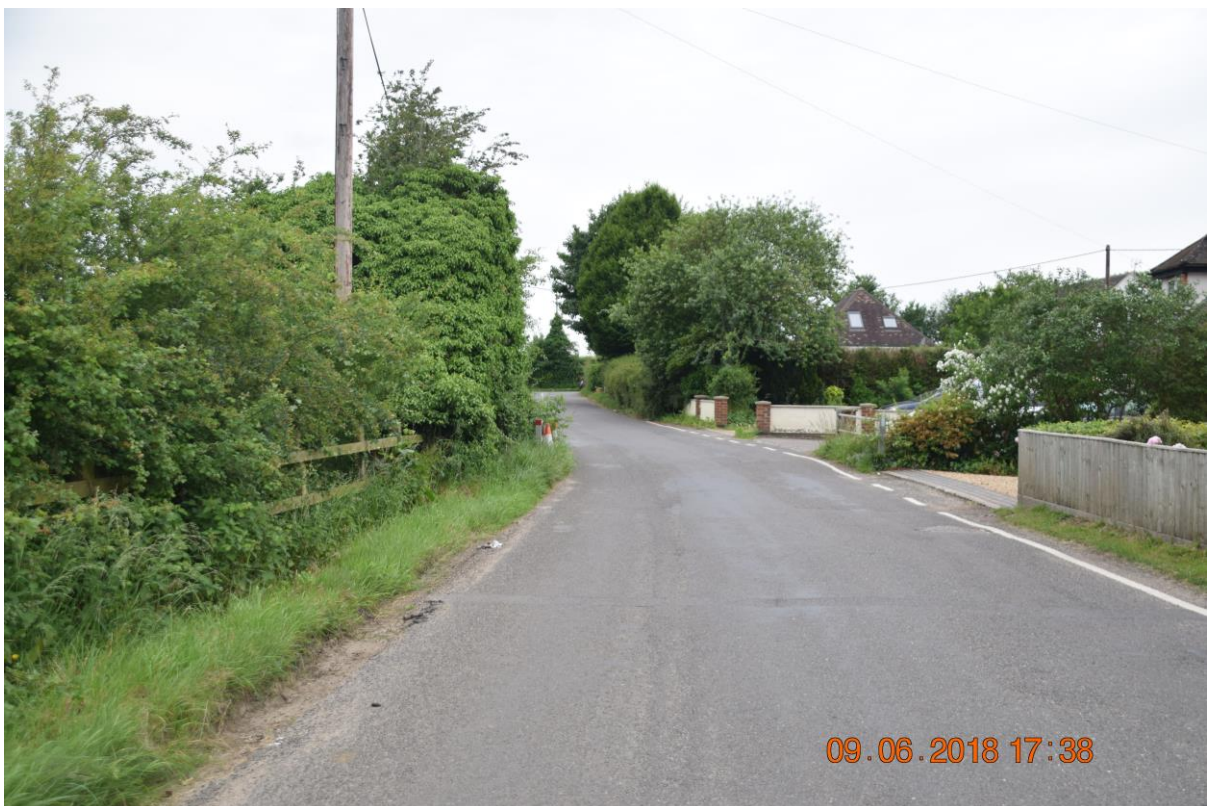
18. Sunningwell road route looking towards the Wootton Road. The safeguarding straddles the hedgerow on the lhs of the picture and crosses a culvert