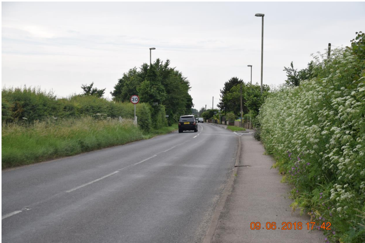
19. Junction of Sunningwell Road / Route and Wootton Road. Picture shows the lack of visibility. Note no safeguarding to lhs of Wootton Road making an “offset” mini roundabout (to slow traffic) unfeasible