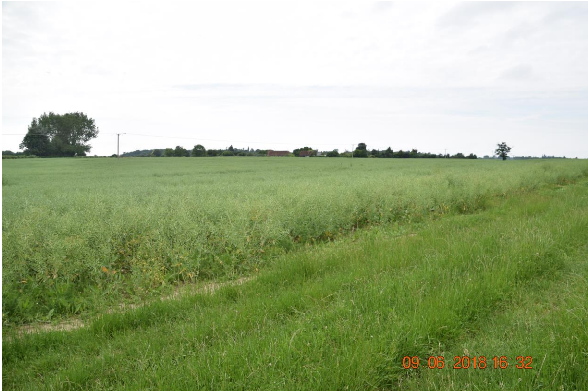
5. Main route runs across picture from clump of trees on the left and then nearer camera than the lone tree on the rhs