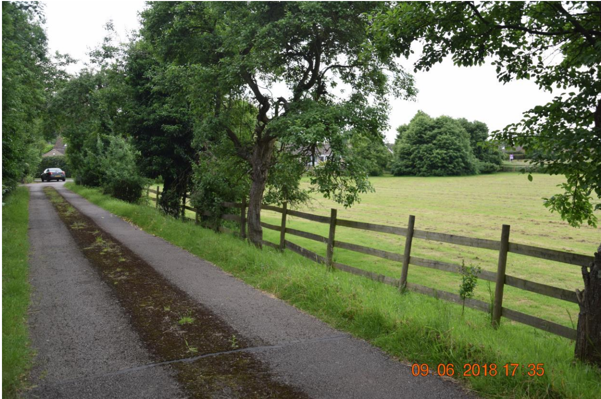
17. Sunningwell Road route crosses the private drive to Long Furlong Farm adjacent to car in photograph