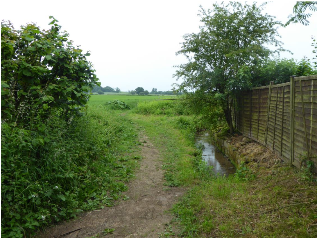
24 Continuation of Wootton Road route running between two houses showing watercourse