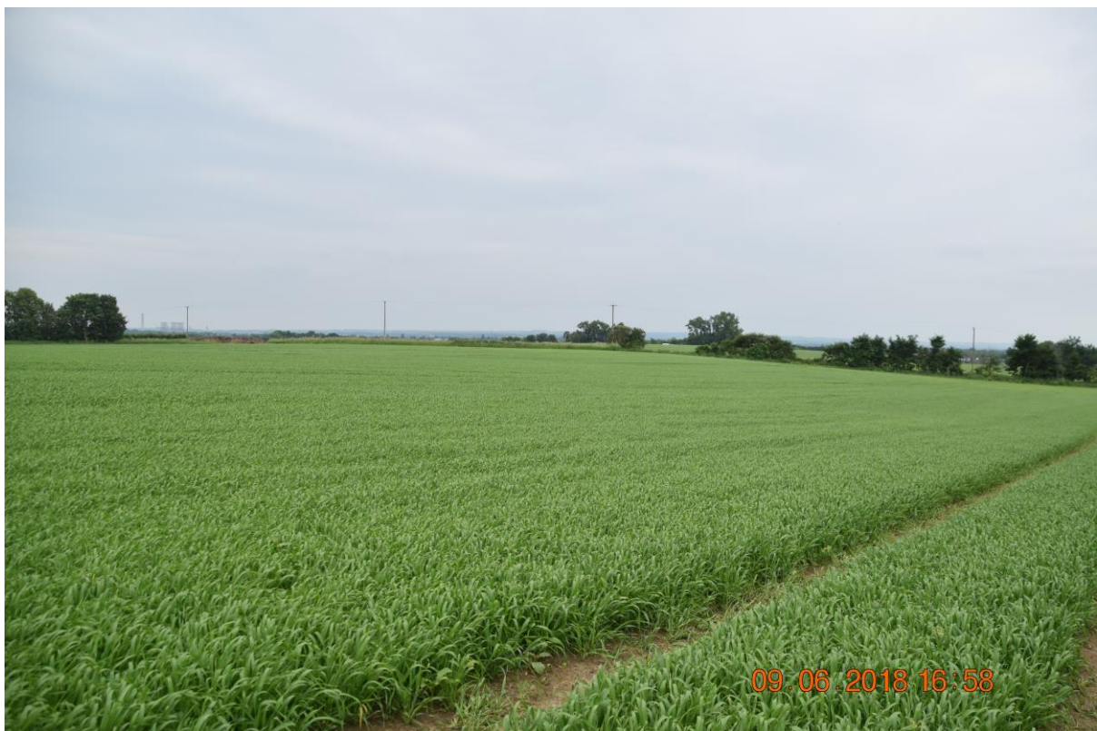
8. Main route runs along the horizon to the centre of the picture and diverges into two legs