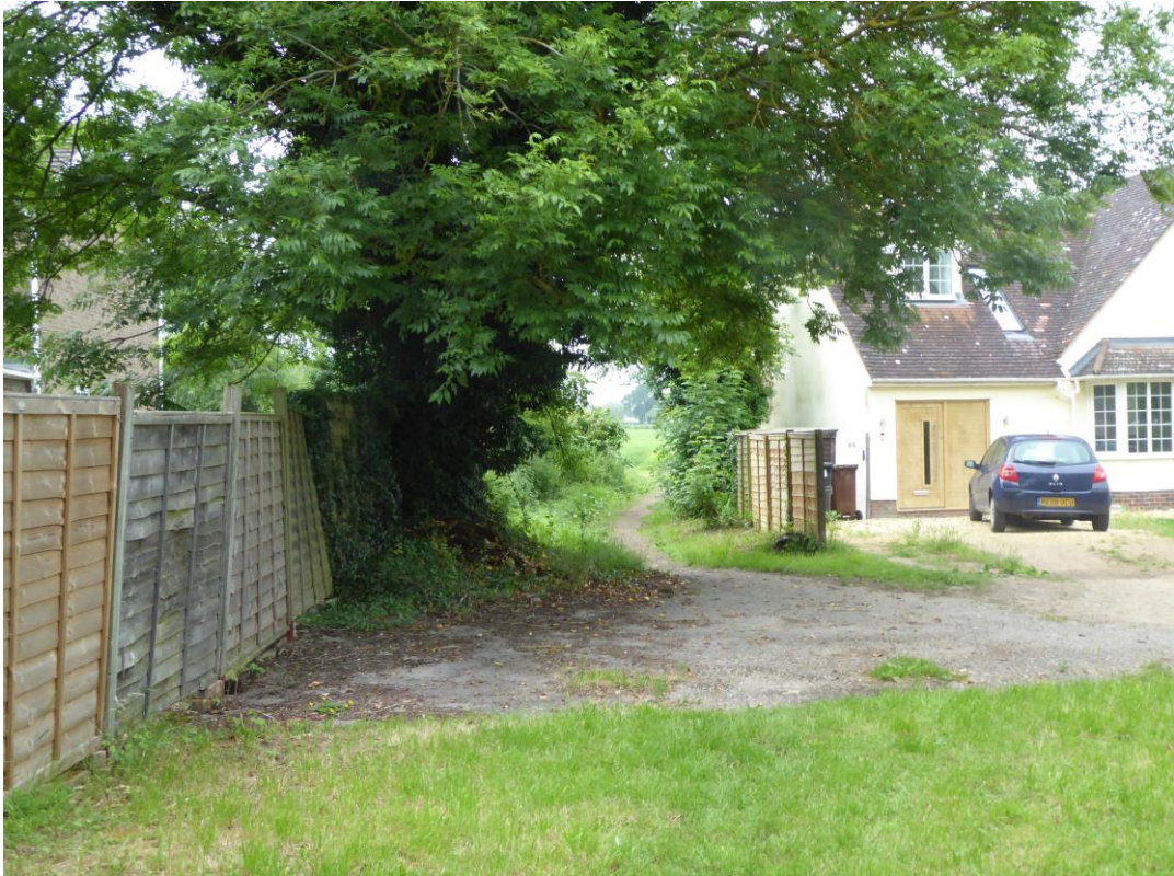
23 Wootton Road route running between two houses