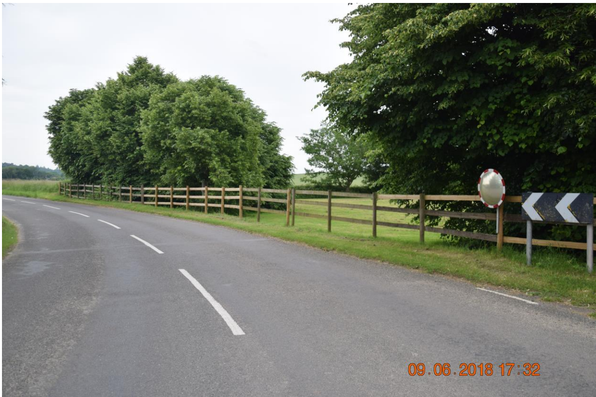
16. Sunningwell Road route runs from this point in a straight line towards the horizon