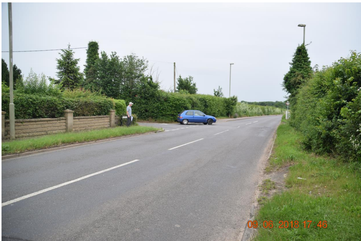
20. Junction of Sunningwell Road / route and Wootton Road from opposite direction