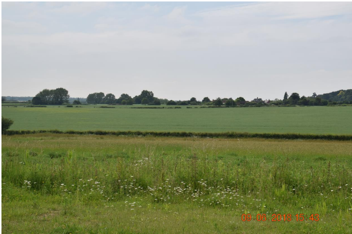
1 Site of proposed Park and Ride looking towards main route of bus/cycle link showing the open nature of the Green Belt Location