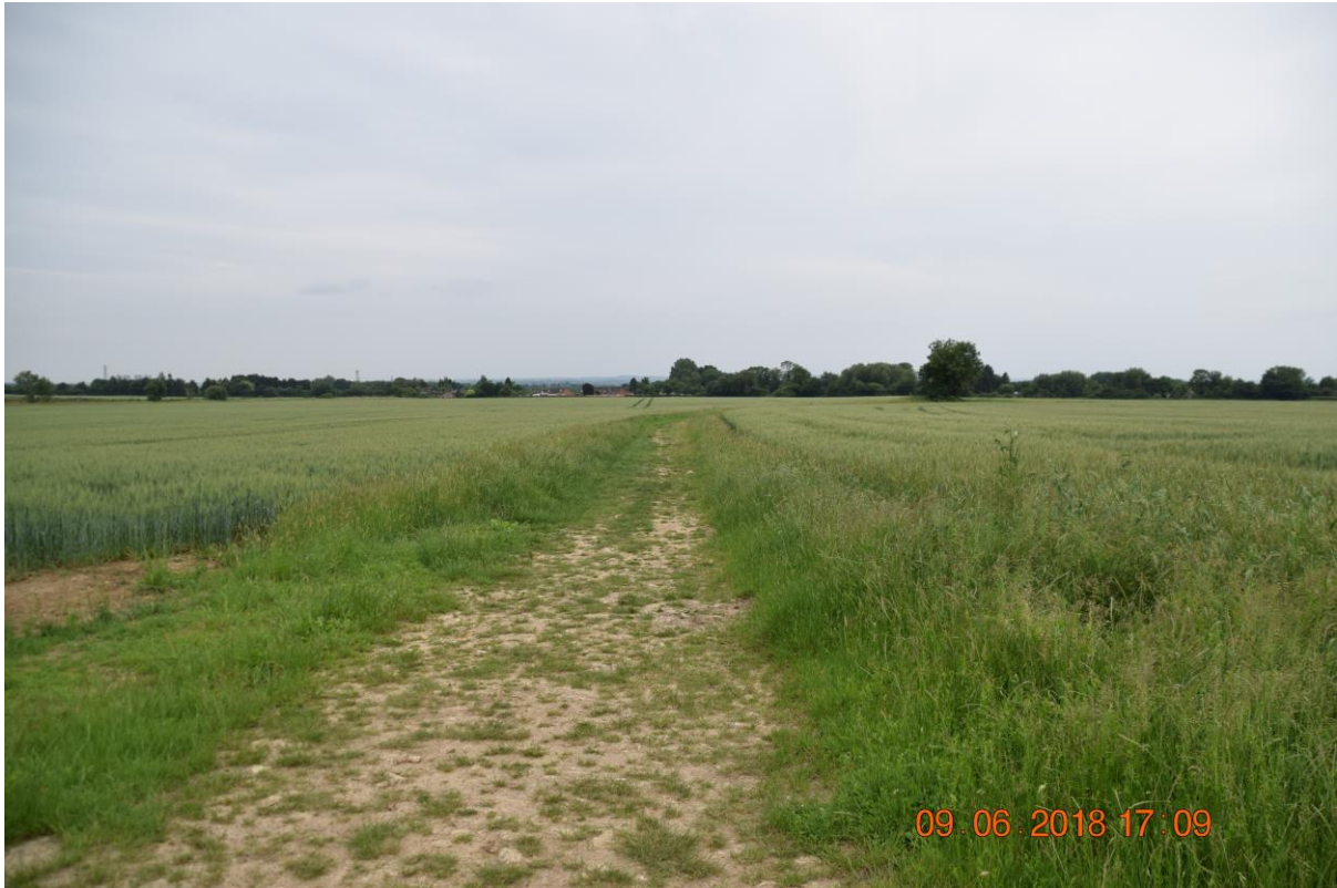
9. Looking south west – Wootton Road route crosses foreground by lone tree. Picture shows openness of the Greenbelt location and further sub-division of the fields imposed by the route