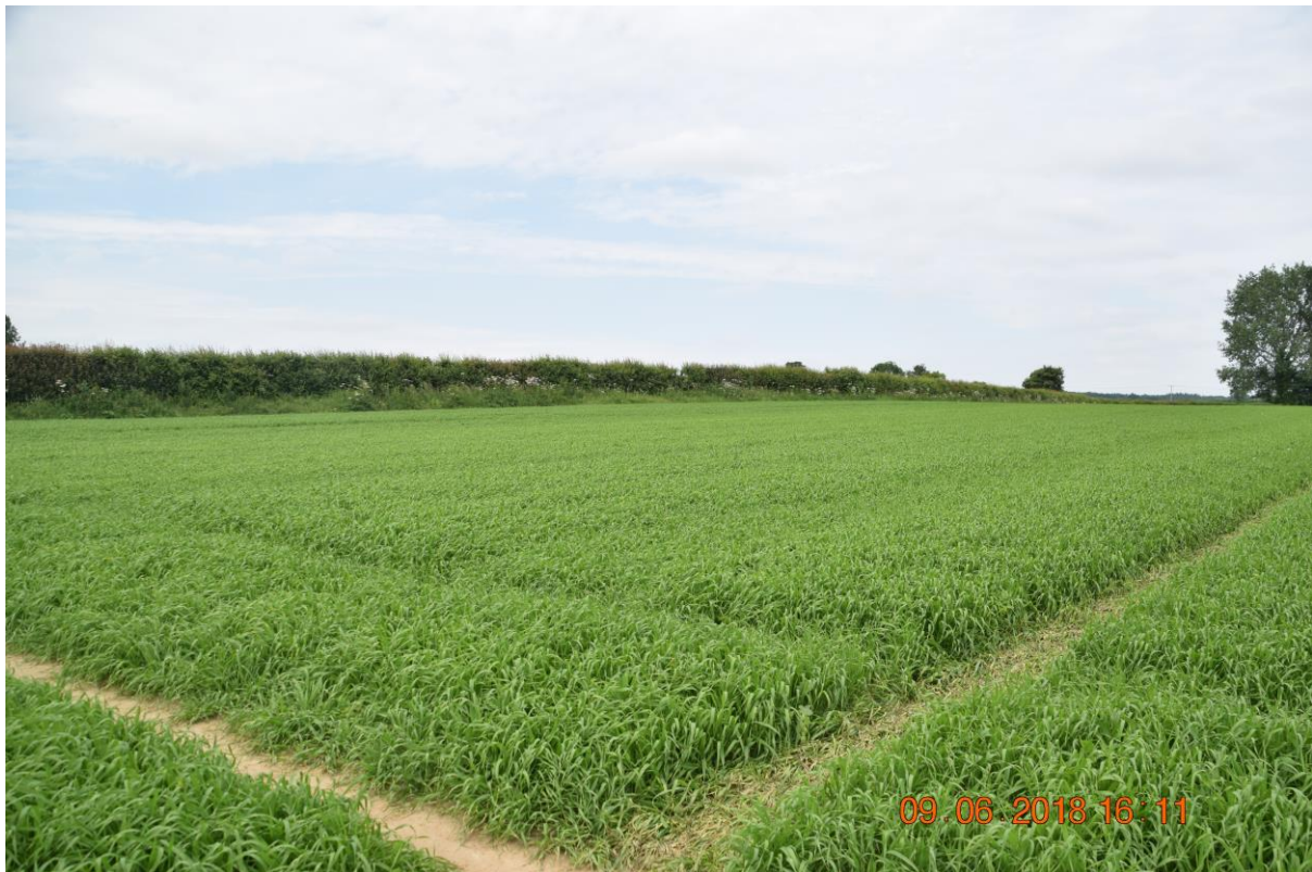
3. Main route on horizon running left to right along hedgerow (note safeguarding map route “straddles” hedgerow so potential loss of hedgerow anticipated). This a continuation of the highest point of the ridge feature running between the A34 and Sunningwell Village.