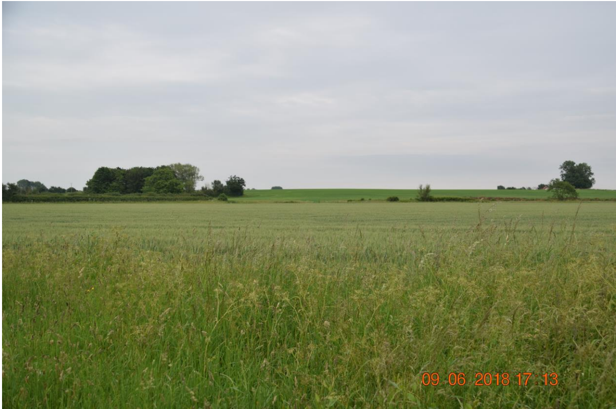
11. Wootton Road route traverses from picture taker position towards trees on lhs and then climbs up to horizon where it joins the Long Furlong leg which passes along the entire length of the horizon