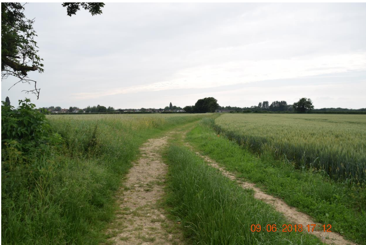
10. Route follows the line of this track to the horizon