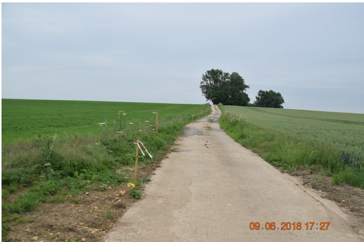
14. Track to "Thames Barns" taken from Sunningwell Road. Sunningwell Road route passes this side of the trees along the horizon across the whole picture. It also severs the driveway to the residential barn conversions