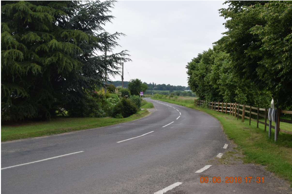
15. Long Furlong route where it diverges from the Sunningwell Road on this 80 degree bend further complicated by the entrance driveway to Long Furlong Farm and other residential drives. Route runs just to lhs of “chevron” sign as further illustrated in the next picture