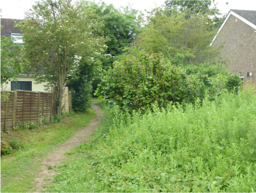
25 Reciprocal of 24 - Wootton Road route running between two houses

Sunningwell Parishioners Against Damage to the Environment