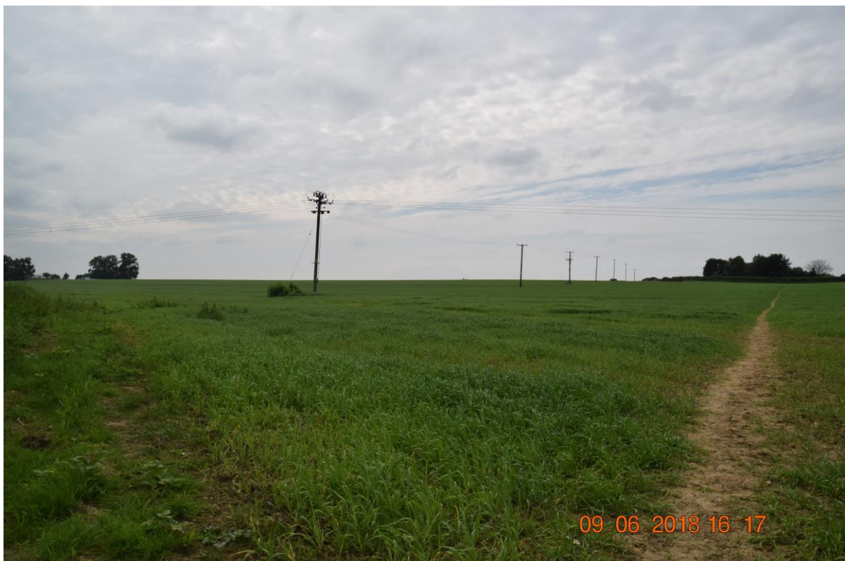
4. Route runs along horizon straddling hedgerow and then splits and proceeds over the brow of the hill. This also shows the highest point of the ridge feature running between the A34 and Sunningwell Village.