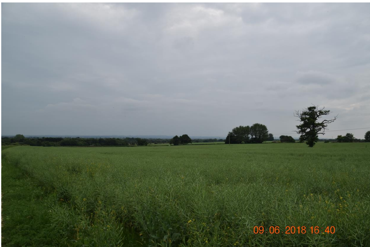
6. Looking along the line of the main route which runs to the lhs of the lone tree towards the large clump of trees centre right. This picture illustrates the sub-division of one of numerous fields caused by the route