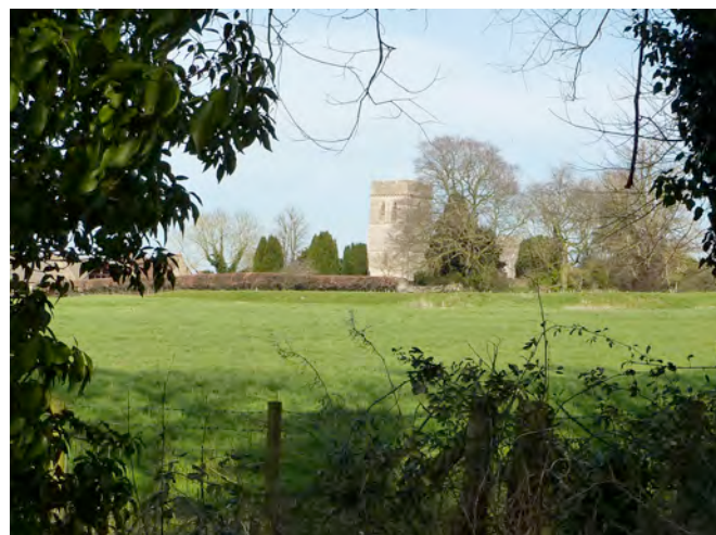
Left hand map: Land packets in Cumnor removed from Green Belt protection by Local Plan Part I Right hand picture: View across land packet 24 – typifies Green Belt quality in all these packets.