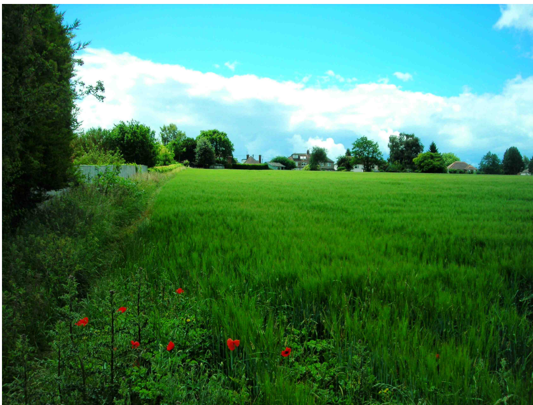
View looking south across Area 3 from public footpath 184/41