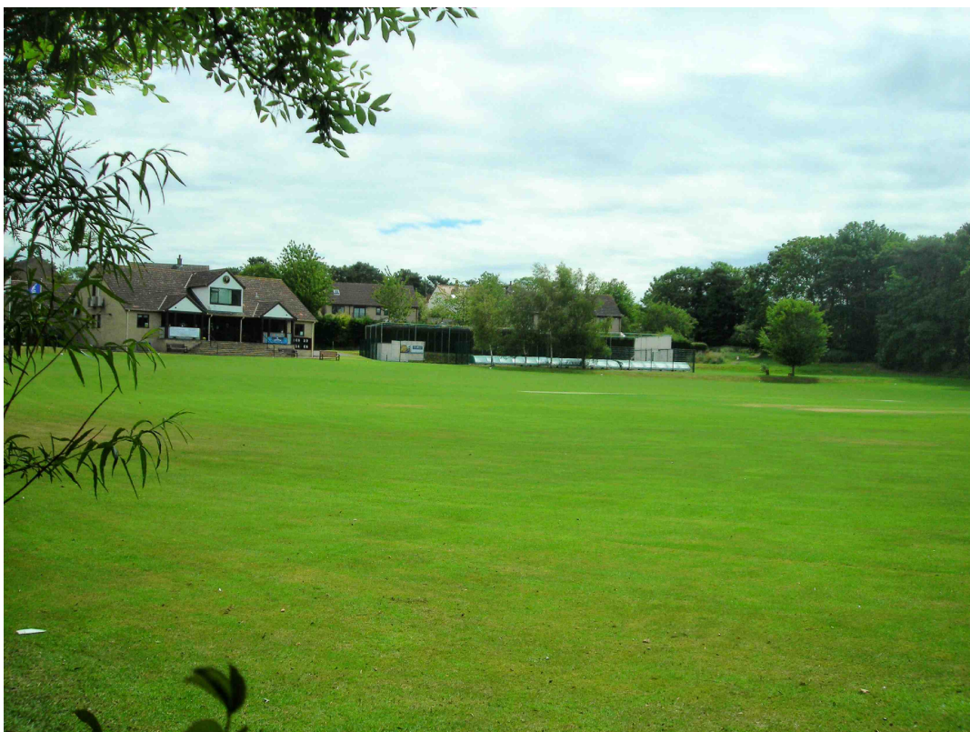
View looking east across the cricket ground in Area 24

61. Area 24 includes a large part of the village Conservation Area and Cumnor cricket ground. It is bounded by public footpaths 184/12 and 184/24 and is essential to the landscape setting of Cumnor and the open and rural character of the Conservation Area. It is a green area partly used for sport and recreation which reaches into the heart of the village.