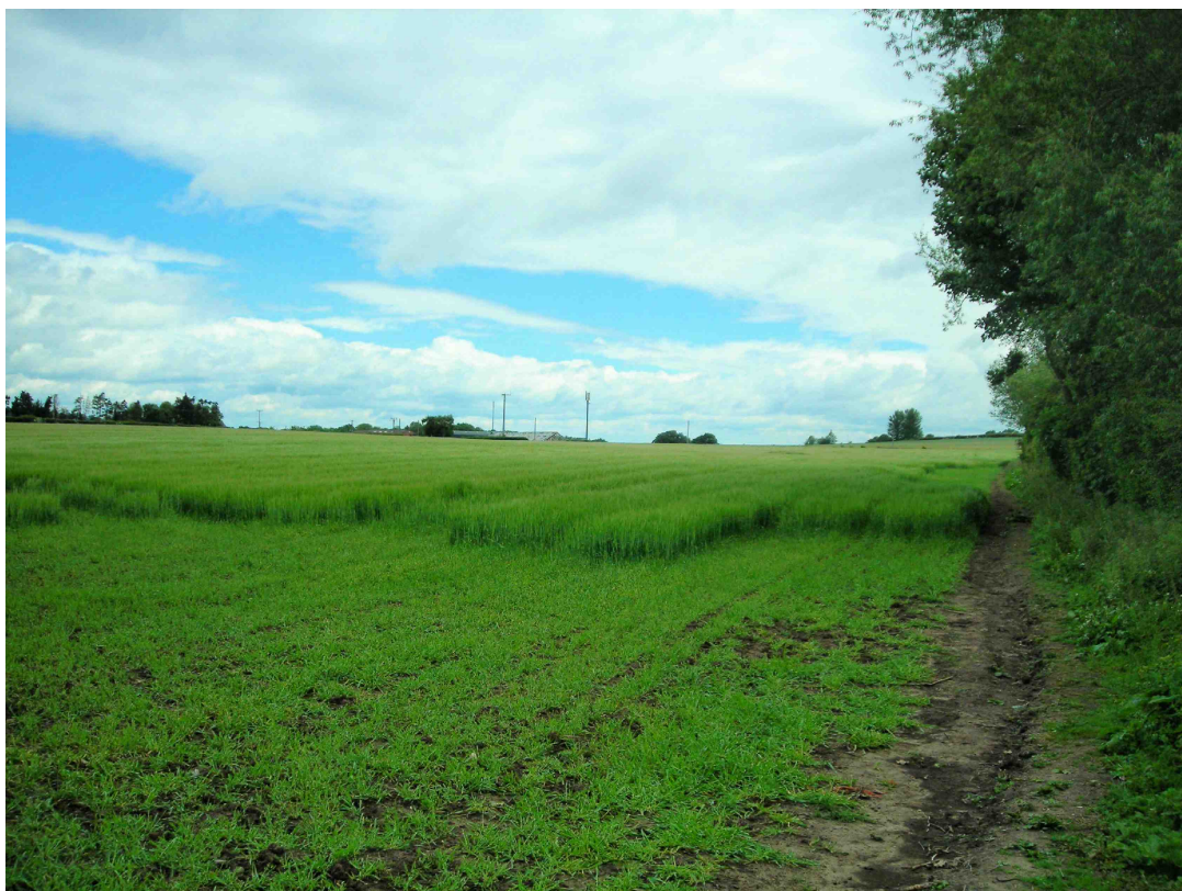
View looking north-west across Area 4 from public footpath 184/18

40. There can be no doubt about the positive contribution Area 4 makes to the openness of the Green Belt. It comprises a large tract of open agricultural land and is prominent in public views as it is crossed or bounded by public footpaths 184/15, 184/16 and 184/18. The land forms part of sweeping open countryside to the north of Cumnor and part of the western edge lies within Cumnor Conservation Area. There is also a question of consistency here. Why has Area 4 been considered for removal from the Green Belt but not adjoining land on the east side of Denman's Lane which lies closer to the village centre and so intrudes less into the open countryside? This has not been explained and is another example of how partial the Green Belt Review has been.