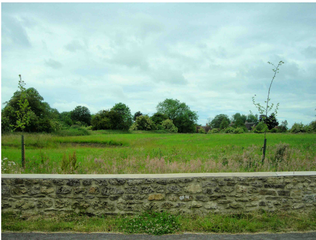
View looking south-west across Area 5 from High Street

49. Area 5 lies wholly within the village Conservation Area and includes Closes Field recreation and playing fields area. It is crossed by public footpaths 184/26 and 184/28 and is essential to the landscape setting of Cumnor and the open and rural character of the Conservation Area. It is a green area partly used for sport and recreation which reaches into the heart of the village.