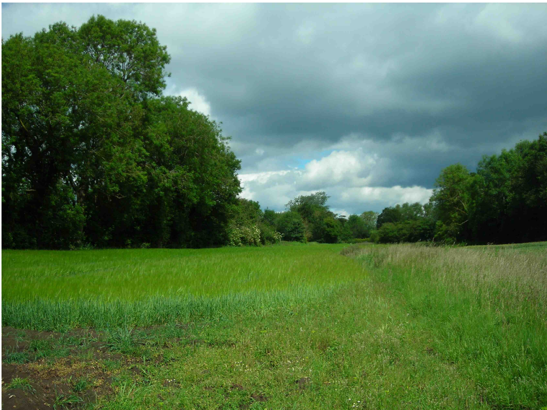
View looking north across Area 6 from public footpath 184/12

56. The Landscape Capacity Study which is part of the Submission Local Plan's evidence base confirms that the landscape capacity of Area 6 is the lowest of the five categories. In other words, the site scores highly in terms of its overall landscape and visual sensitivity and its landscape value. The landscape and visual sensitivity of the site is enhanced by public footpaths 184/12 and 184/24 crossing the site and the land rising noticeably to the east and west from the