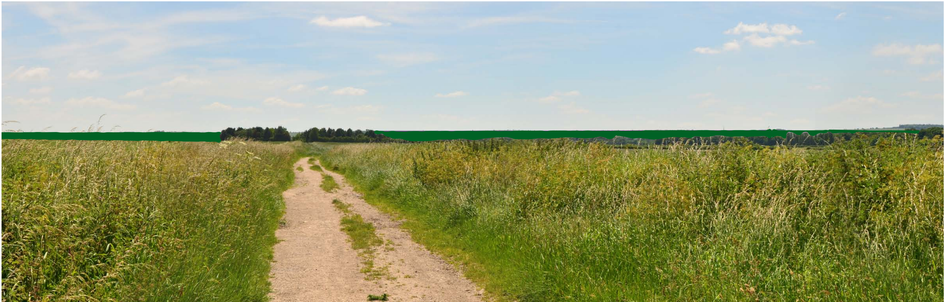
View 2 CENTRE: Indicative extent of Areas A and D - with planting.