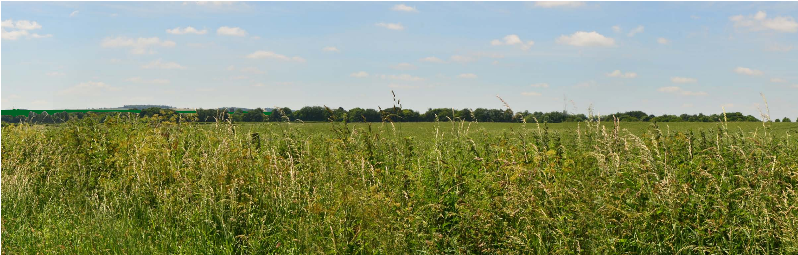
View 2 RIGHT: Indicative extent of Areas A and D - with planting.