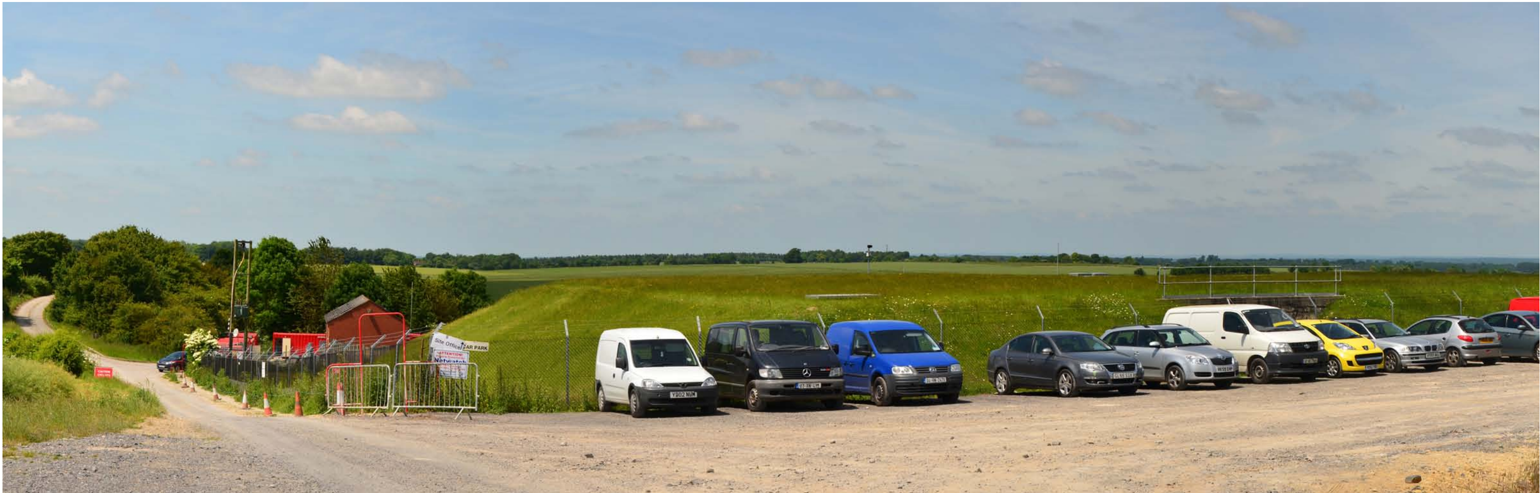
View 1 RIGHT: Existing view.