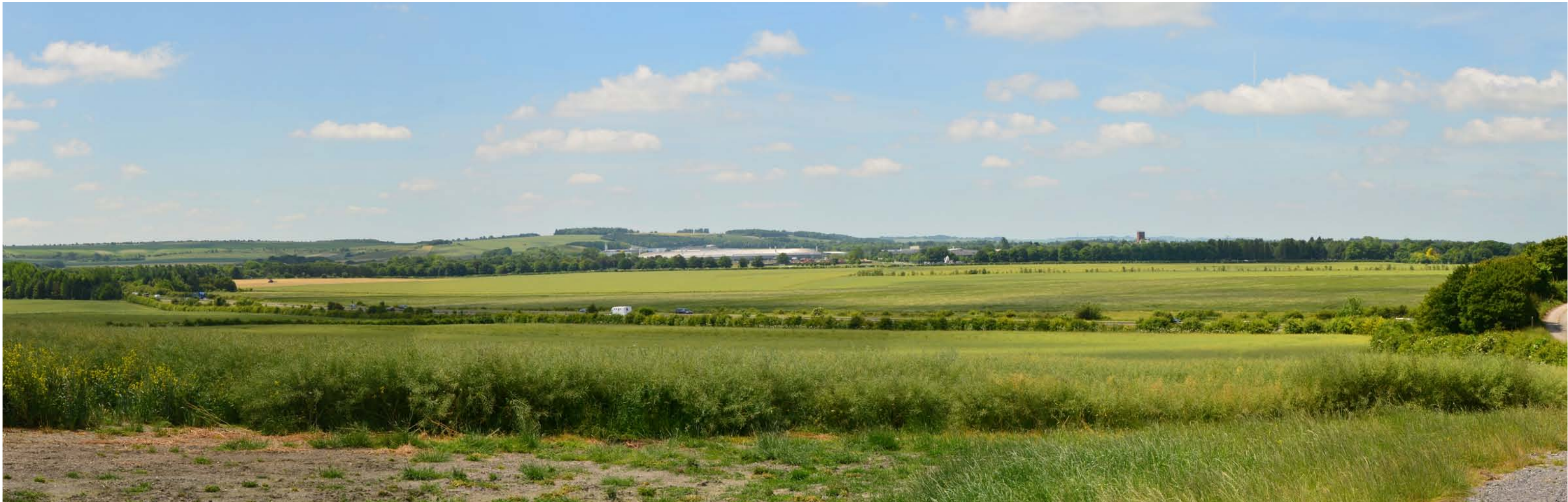
View 1 LEFT: Existing view.