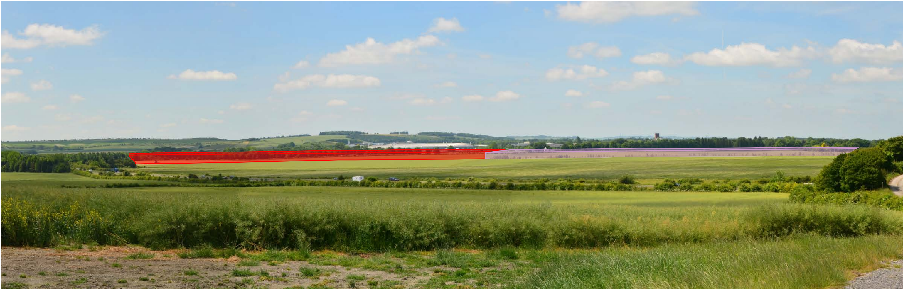
View 1 LEFT: Indicative extent of Areas A and B.