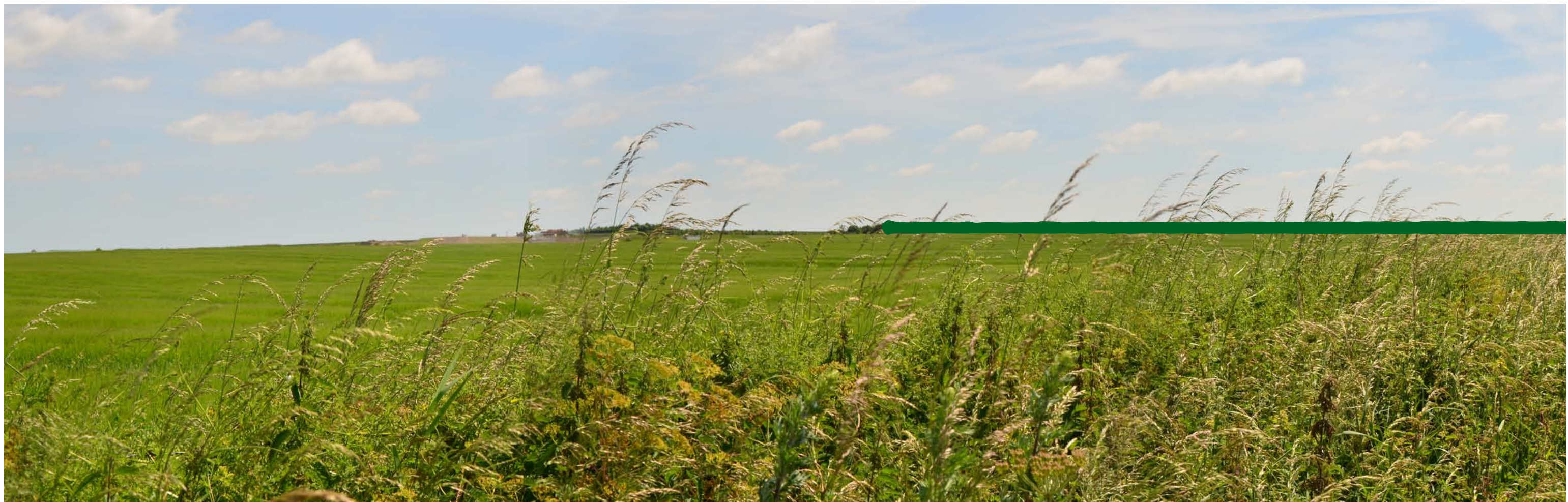
View 2 LEFT: Indicative extent of Areas A, B and G (none visible) - with planting.