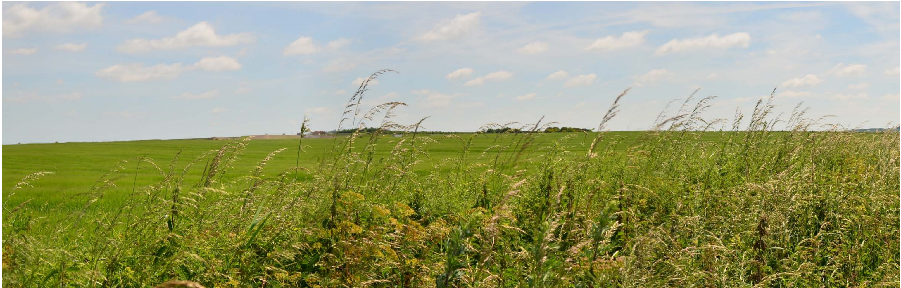
View 2 LEFT: Indicative extent of Areas A, B, C, D and G (none visible).