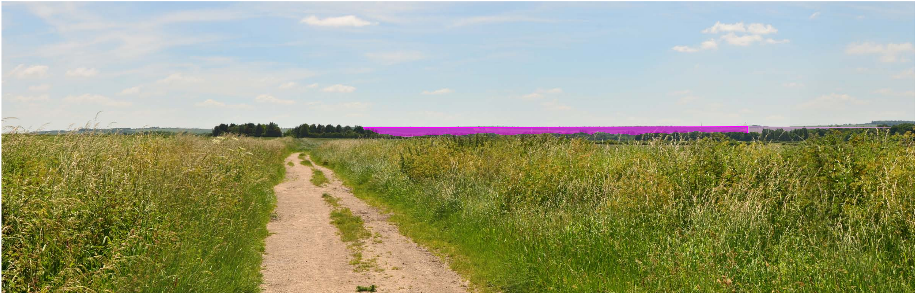
View 2 CENTRE: Indicative extent of Areas A and D.