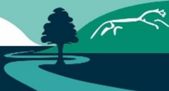
Figure 1: Example of a Biodiversity Impact Plan.