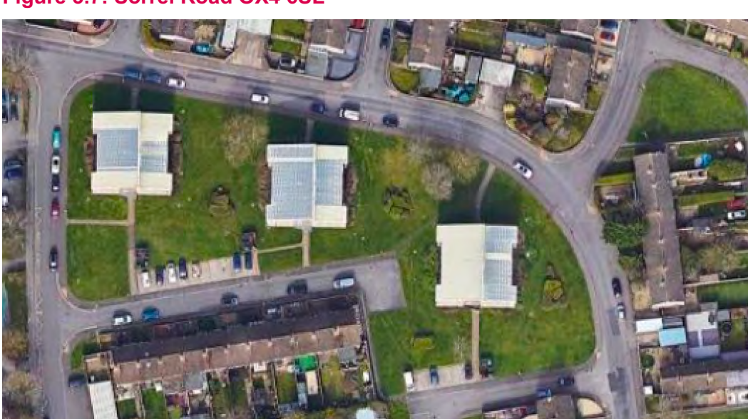
Figure 3.7: Sorrel Road OX4 6SL