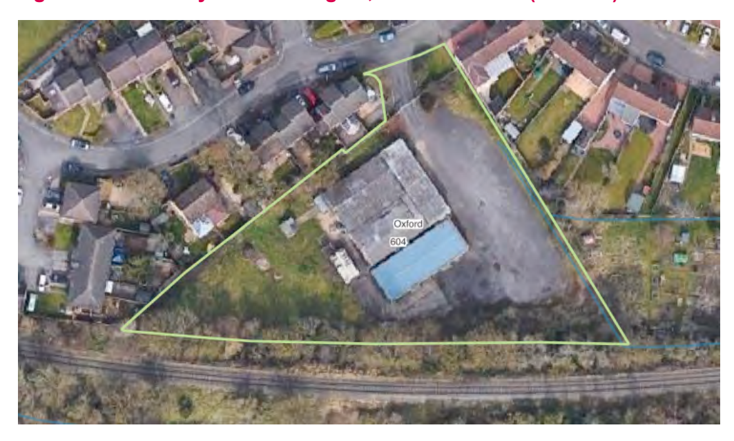
Figure 3.1: The Royal British Legion, Lakefield Road (Site 604)