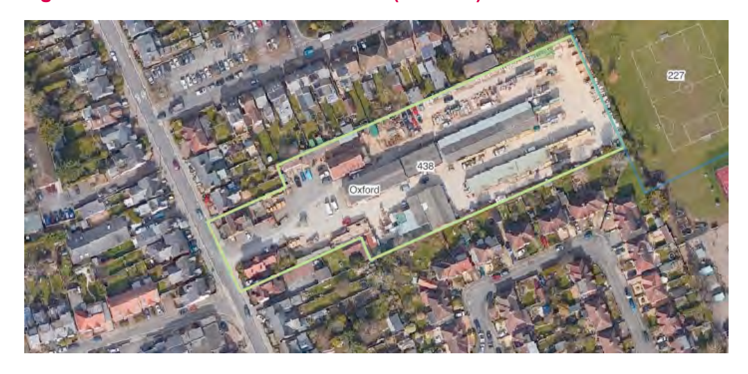
Figure 3.2: Blanchfords Builders Yard (Site 438)

poor use of the available site area and the compatibility of residential development here with surrounding land use activities.