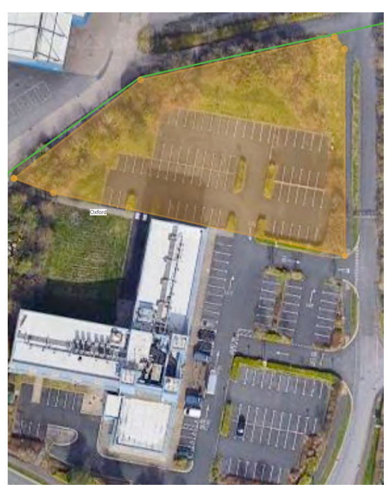
Figure 3.9: Land Adjacent to Allocation SPS2 (Kassam Stadium) and part Car Park of Holiday Inn Express

3.81 For the sites that represent estate regeneration or intensification opportunities we have not provided capacity estimates, however taken alongside the examples set out above, this is an opportunity for OCC to explore through a more proactive analysis of the potential future supply arising.